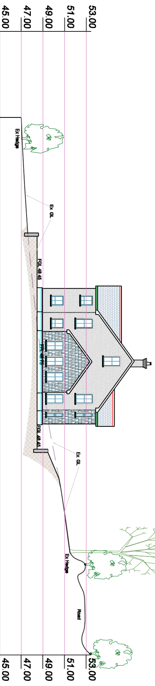
SITE SECTION A-A 1:200

NOTE : Development shall not commence until a water act consent has been obtained for the discharge of sewerage effluent and a copy of consent forwarded to planning service.